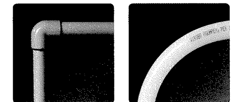
Uponor PEX-a is stronger, more flexible, installs easier and requires fewer connections than CPVC. And fewer connections mean fewer possible leak points.

Uponor Residential Fire Safety Systems use proven AQUAPEX® tubing and ProPEX fittings.